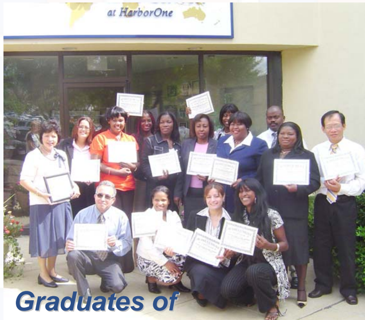
Graduates of ESL Classes