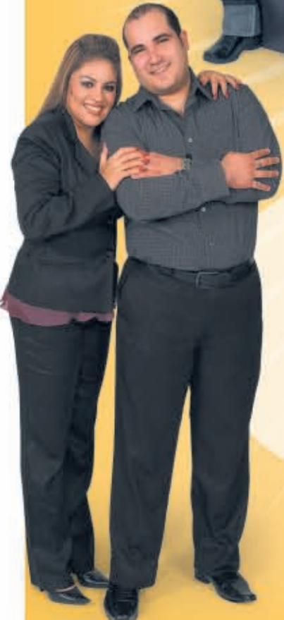
The Cervantes Family KINT-TV